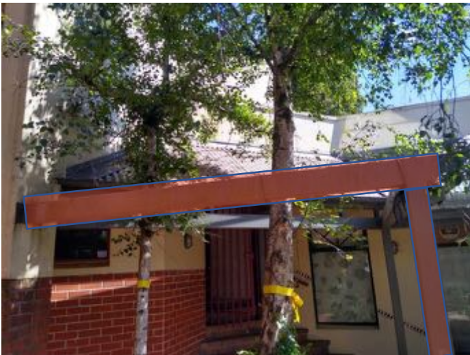
Indicative Site #2/3

The wall in this arch has a lot of potential anchor points.