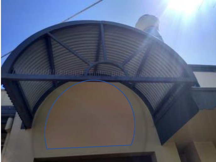
Indicative Site #1/3

The wall in this arch has a lot of potential anchor points.