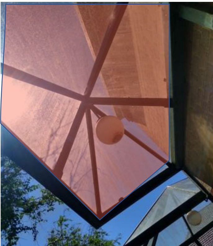
Indicative Site #3/3

The steel frame is a solid structure and could support a sculptural installation or a wrapping of the bar.